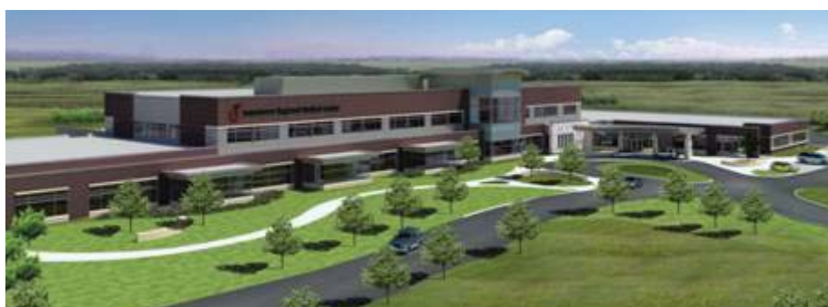
Jamestown Regional Medical Center

However, there will be visible activity on the site starting in Fall 2009. Access roads will be built to the site allowing for a more efficient start in 2010.