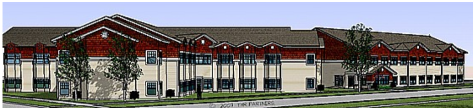
Hillsboro Medical Center - Nursing home / Assisted Living / Hospital Remodel Diagram

For additional information visit the Hillsboro Medical Center website at http://www.hillsboromedicalcenter.com/building_project.htm