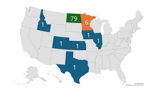
Figure 2. Current Employment Status (n = 91)