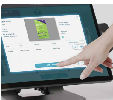
Informative Graphical Interface